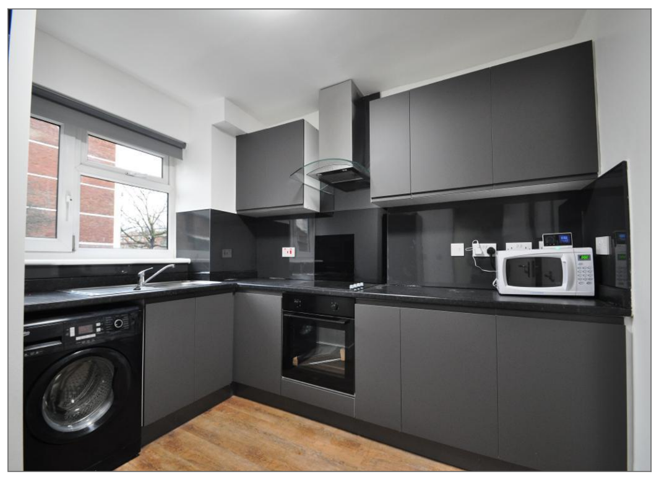
Abbey Street SE1